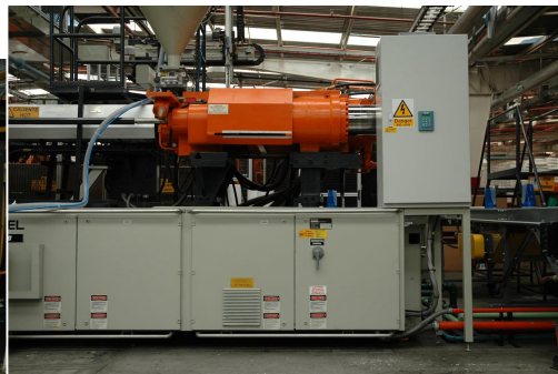
single 90kW SyncroSpeed enclosure mounted on Engel ES4550/600