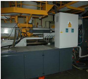
two-motor SyncroSpeed enclosure mounted on Engel ES4400/500